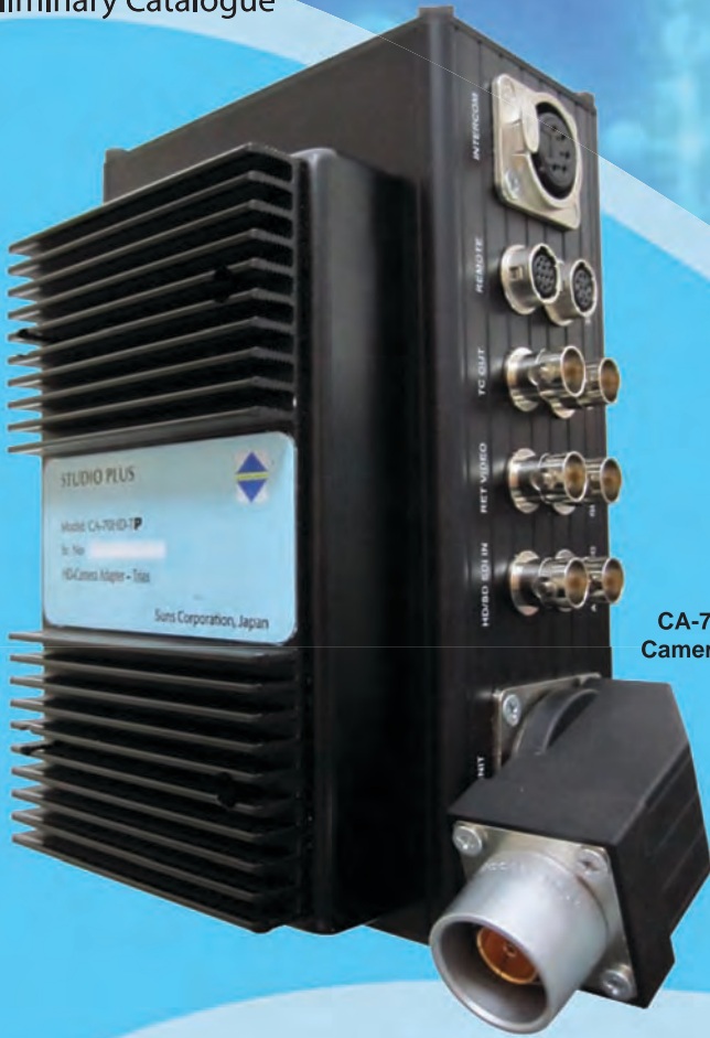
CA-70HDT(X) Camera Adapter